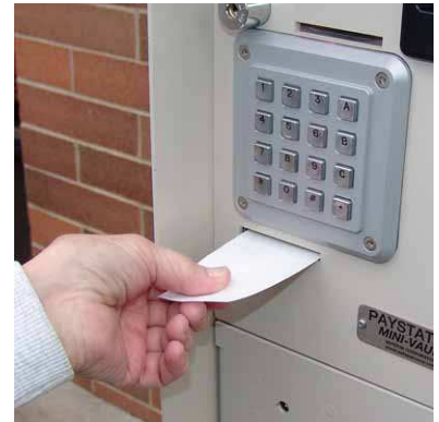
3. Take manifest.