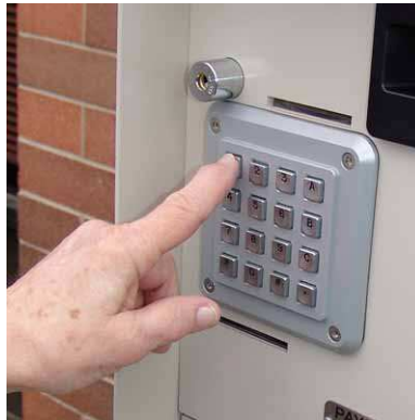
2. Enter manifest code.