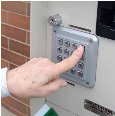
1. Enter ID code.