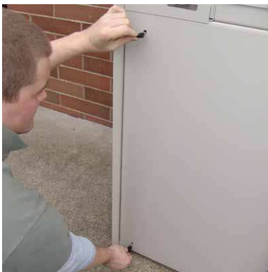
4. Unlock chest door.