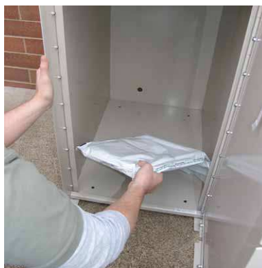
5. Remove deposits.